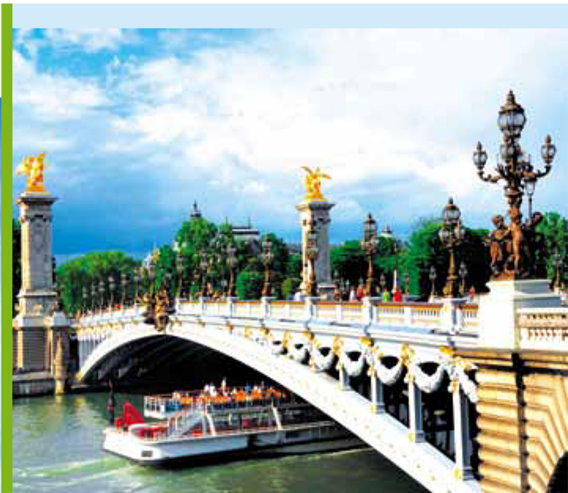
Pont Alexandre III - Paris

After a buffet breakfast, the day is at leisure OR opt for an experience to Disney Magic as you visit Eurodisney -