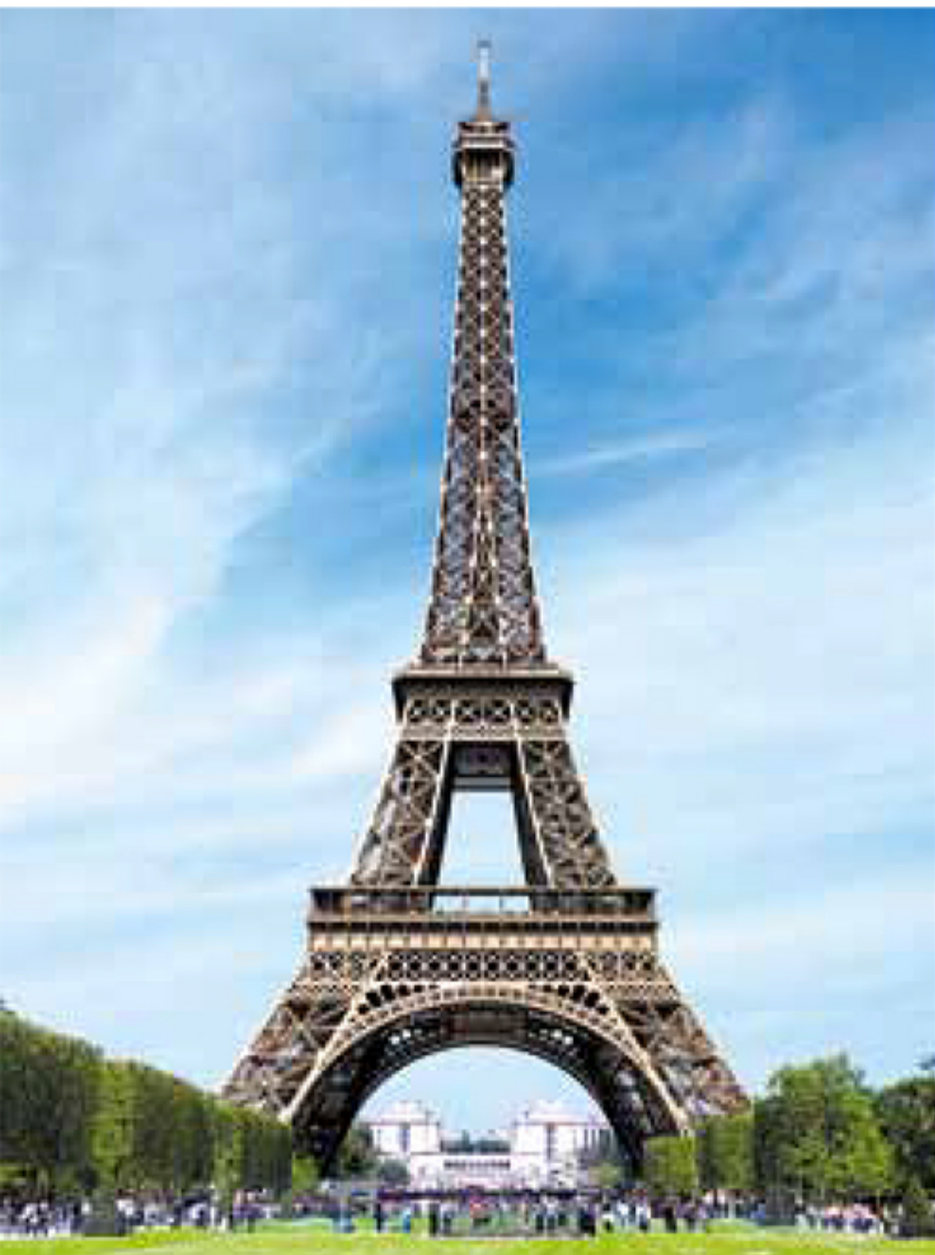
Eiffel Tower - Paris

After a buffet breakfast, check out and proceed to the French Capital - Paris, a city seeped in history, art and fashion. On arrival depart for restaurant in Paris for lunch. Visit the 3rd level of the Eiffel Tower - an unparalleled experience. Next, proceed on a guided city tour with an experienced local English speaking guide. Enjoy many sights like the Arc De Triomphe, Concorde Square, Opera House, Champs Elysees, Invalides and many more landmarks.