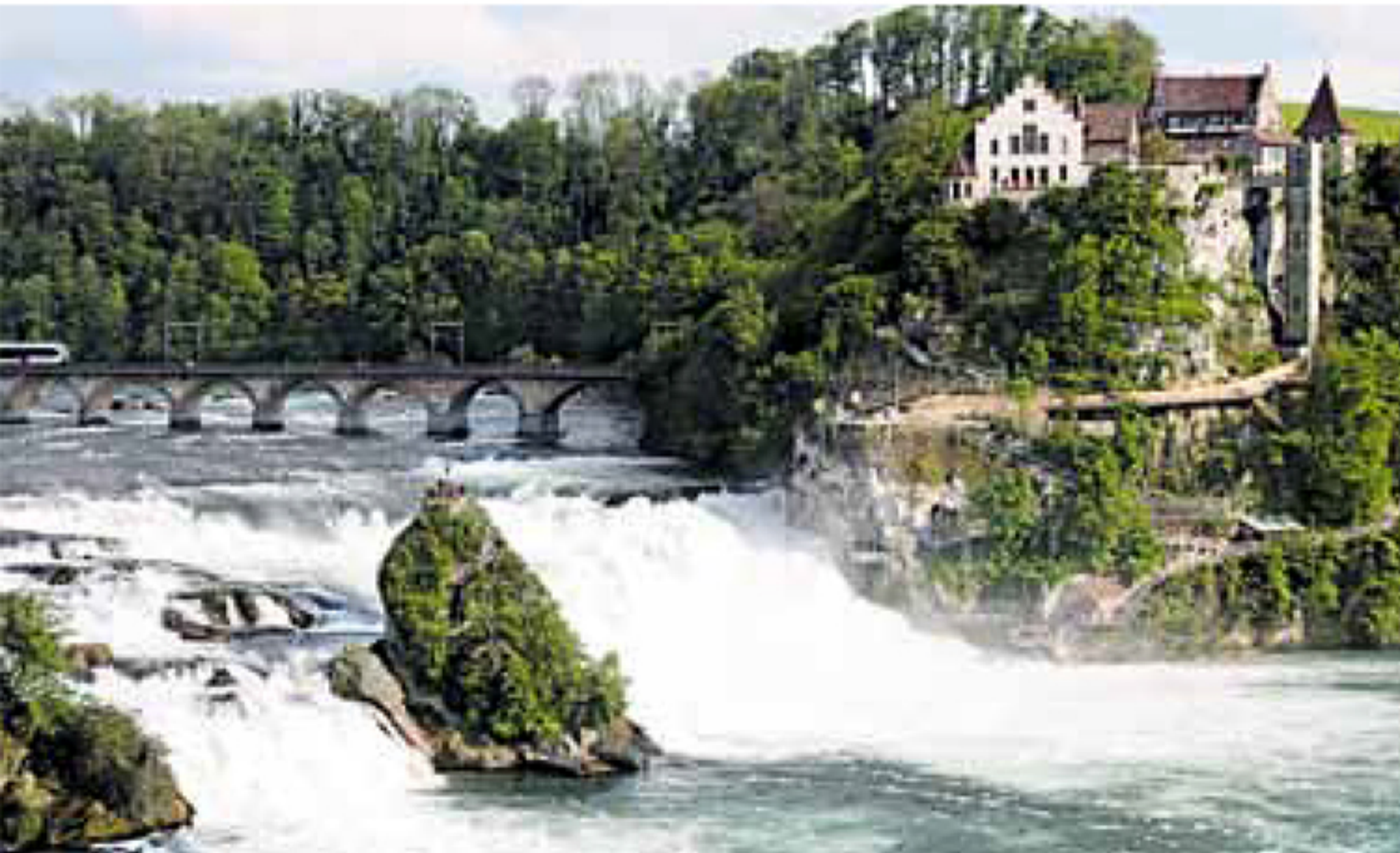
Rhine Falls – Schaffhausen