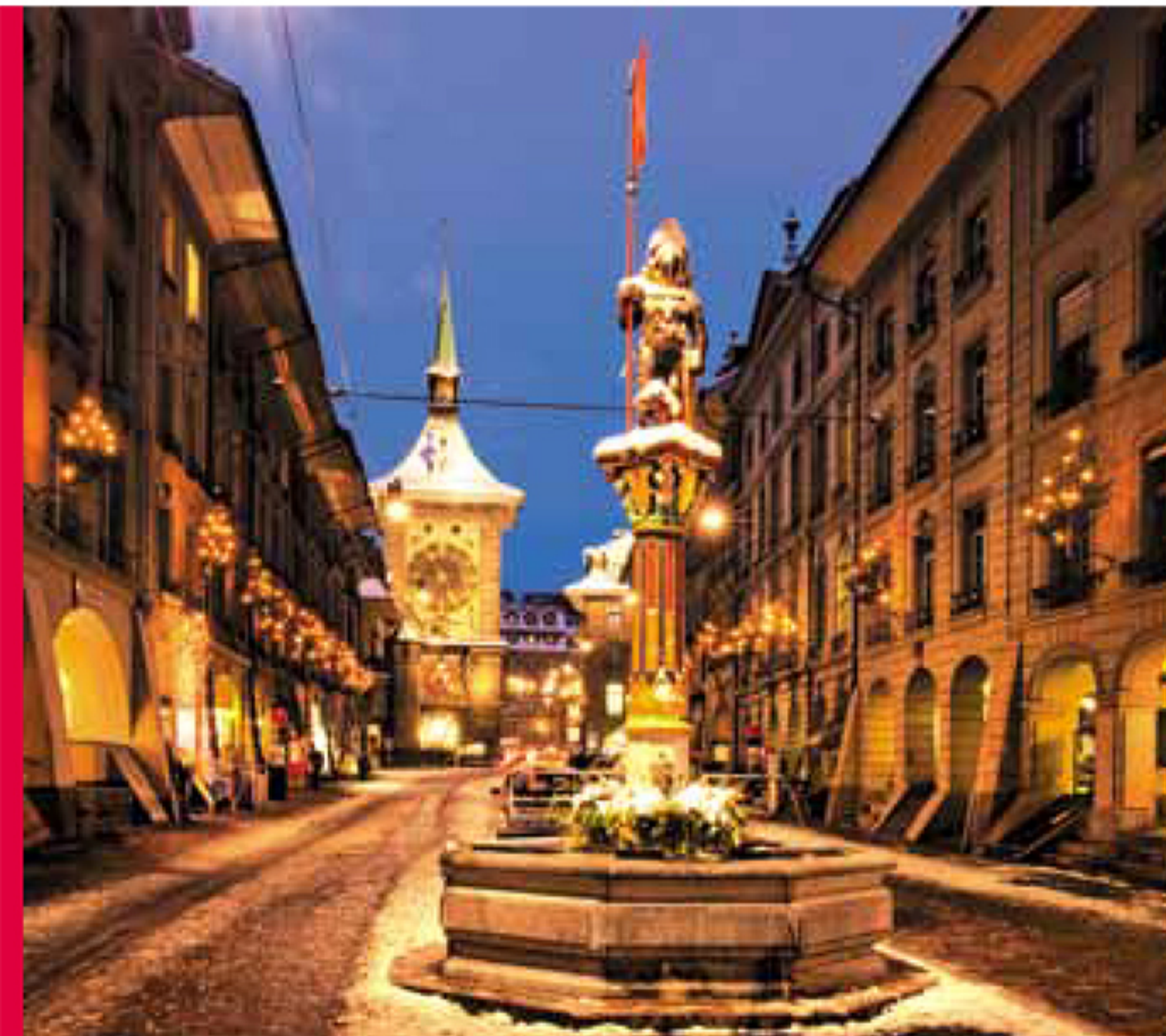
Bern – The Swiss Capital

Overnight at hotel Kyriad Bourge En Bresse / Mercure / Ibis or similar in Bourge en Bresse. (B, L, D)