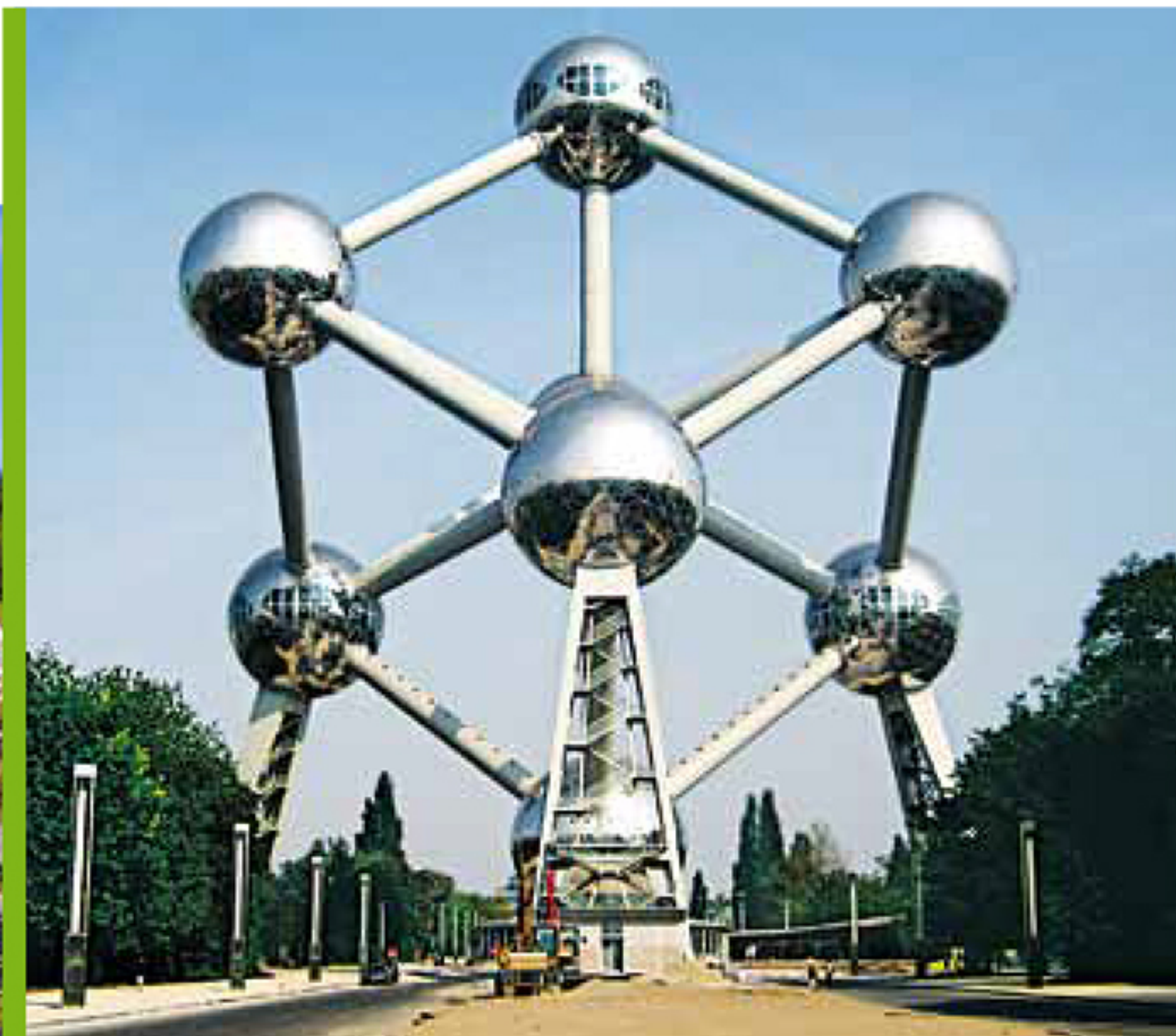
Atomium - Belgium

city tour with an experienced local English speaking guide. Enjoy many sights like the Arc De Triomphe, Concorde Square, Opera House, Champs Elysees, Invalides and many more landmarks. After lunch, visit the ultimate art museum - The Louvre which houses art forms created by the best artists in history, including the legendary and mystical Mona Lisa. Later, visit the Fragonard Museum and get an insight on how French Perfumes are made. You also