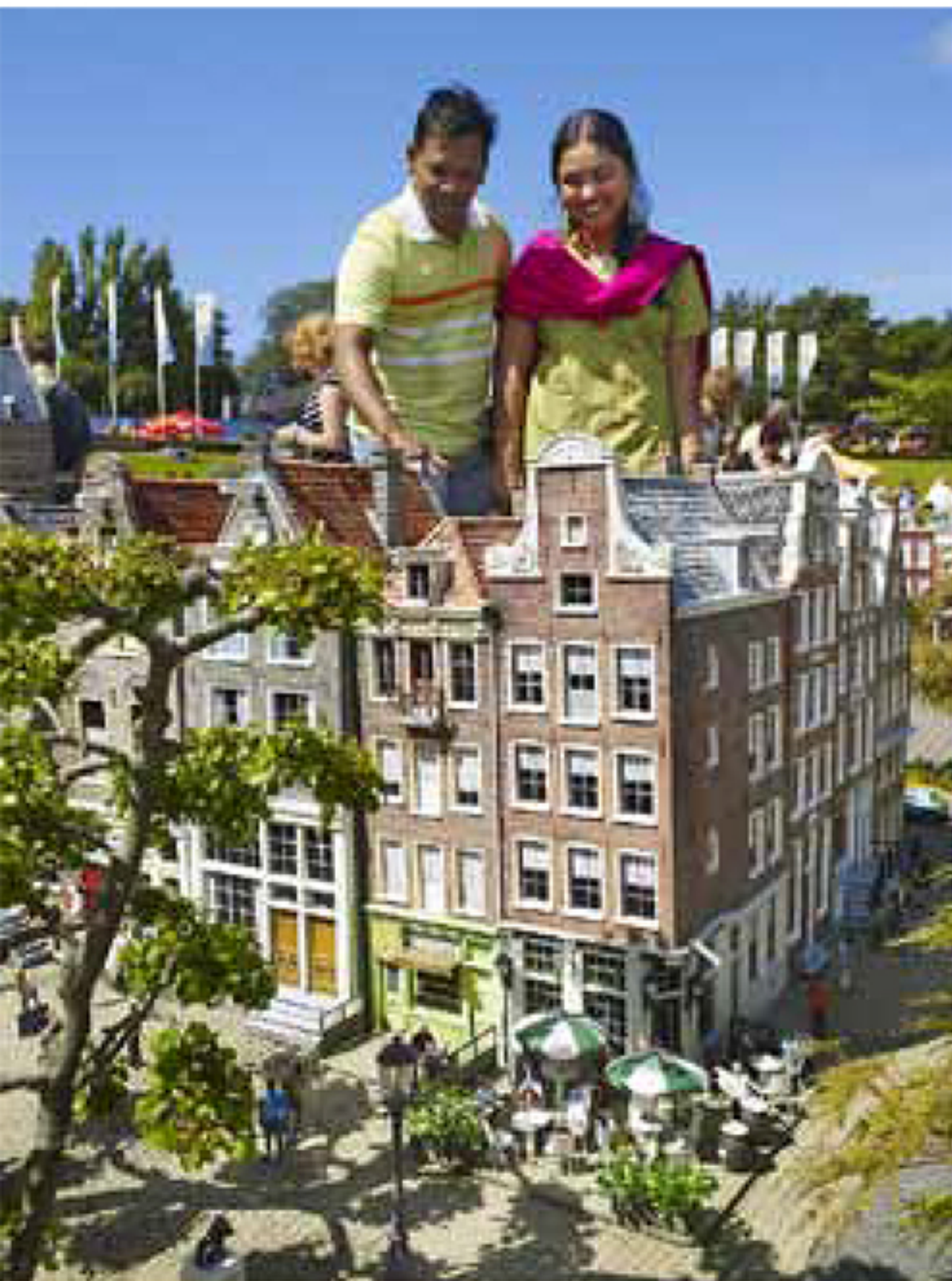
Madurodam - The Netherlands

After a buffet breakfast, proceed to Den Haag. On arrival, visit Madurodam, Holland in miniature where you see all of Holland's important sights built on a 1:25 scale. After lunch, drive to Lisse to experience the ultimate Tulip Extravaganza - Keukenhof (till 16th May). 17th May onwards, visit Zaanse Schans - a working museum with