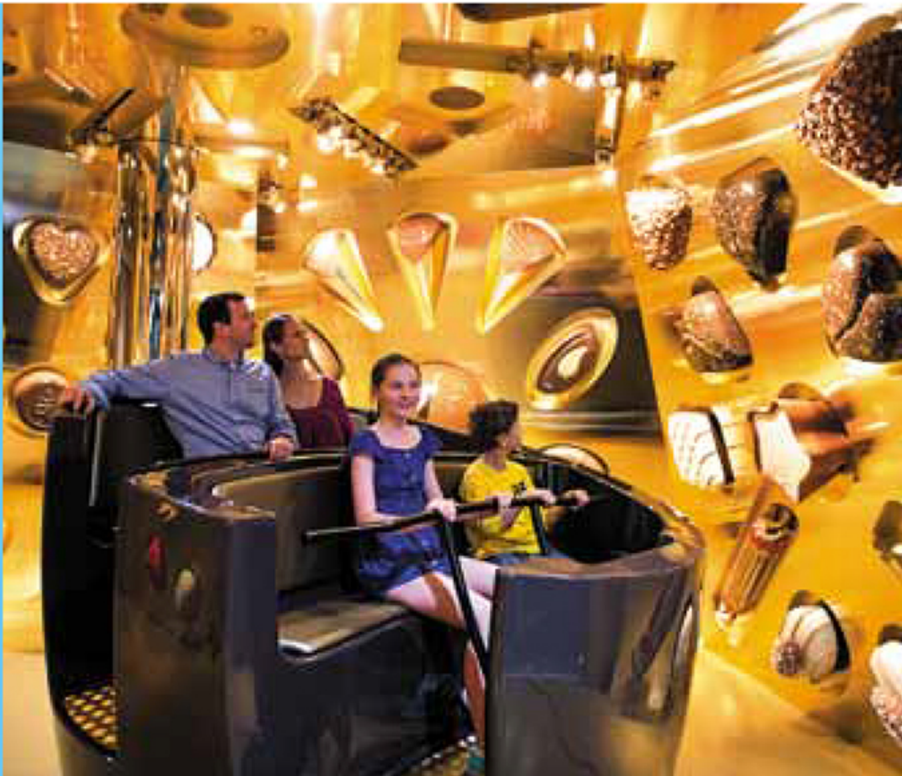
Chocolate Experience – Lucerne

After a buffet breakfast, check out and drive to the quaint village of St. Goar, located in the central Rhine valley and board your Rhine cruise. This cruise will expose you to some of Germany's most stunning landscapes cruise through the wine region and enjoy views of old castles as you arrive into Boppard. Next, drive to the city of Cologne - home of the famous Eau de Cologne. Get fascinated by the sight of the massive Cologne Cathedral