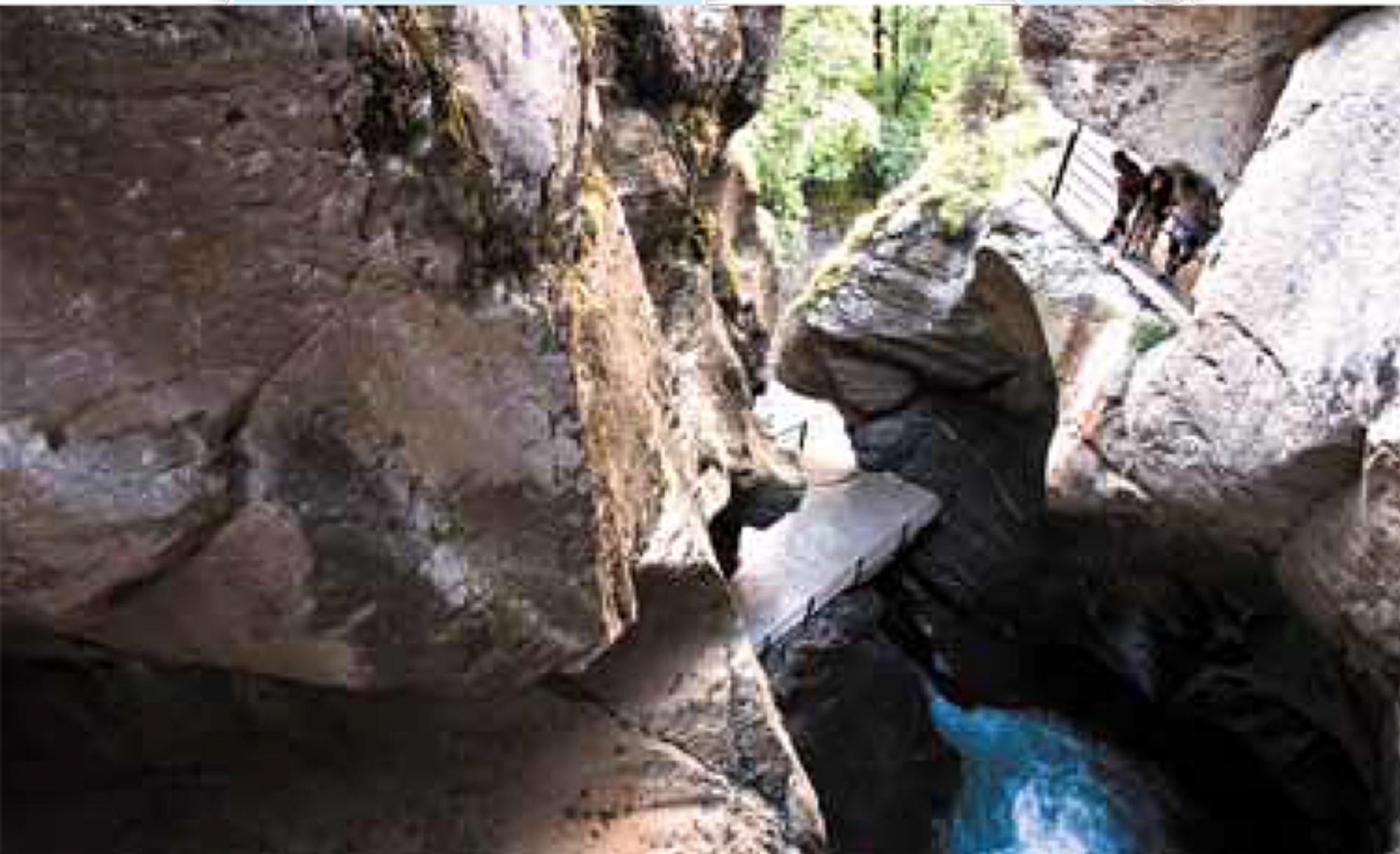
Spectacular Trummelbach Falls

Mt Titlis - A landscape close to heaven. Lucerne - Orientation Tour. Cruise on