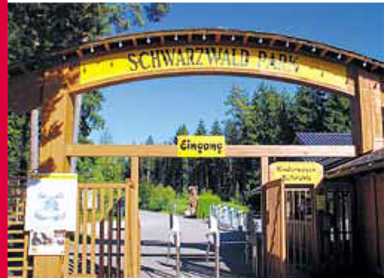
Schwarzwald Park – Black Forest

Overnight at hotel NH / Park Inn / Mercure or similar, in Mannheim / Viernheim. (B, L, D)