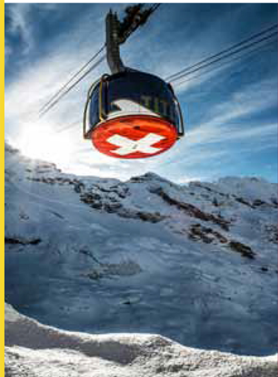
Rotair to Mt Titlis

your way up to Mt. Titlis (3020 mts.). Here, visit the Ice Grotto and indulge yourself in the world of snow and enjoy a cliff walk (weather permitting). After lunch, drive to the beautiful lakeside town of Lucerne. See the dramatic Lion Monument and the Kapell Brücke as you soak in the beauty of this city. You also have some free time for shopping of the world renowned Swiss watches, Swiss knives, chocolates, souvenirs, etc. Tonight, enjoy an Indian dinner.