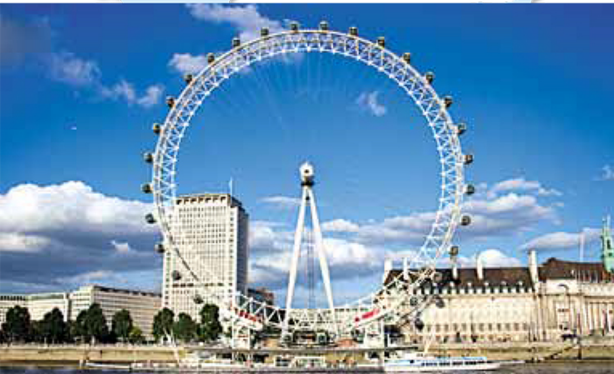
Spectacular, London Eye

After a buffet breakfast, check out and proceed to St. Pancras station to board