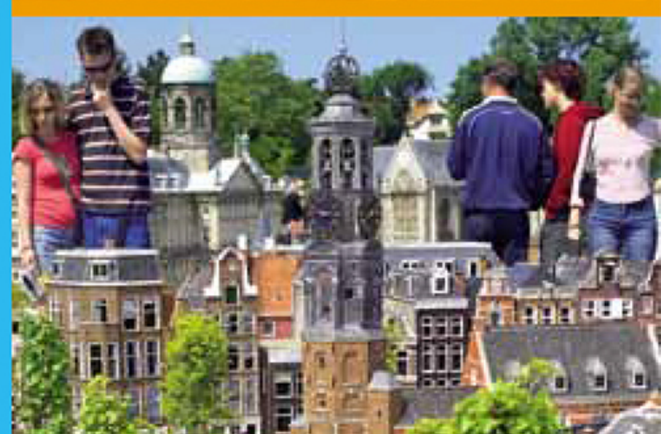
Madurodam - Holland in miniature