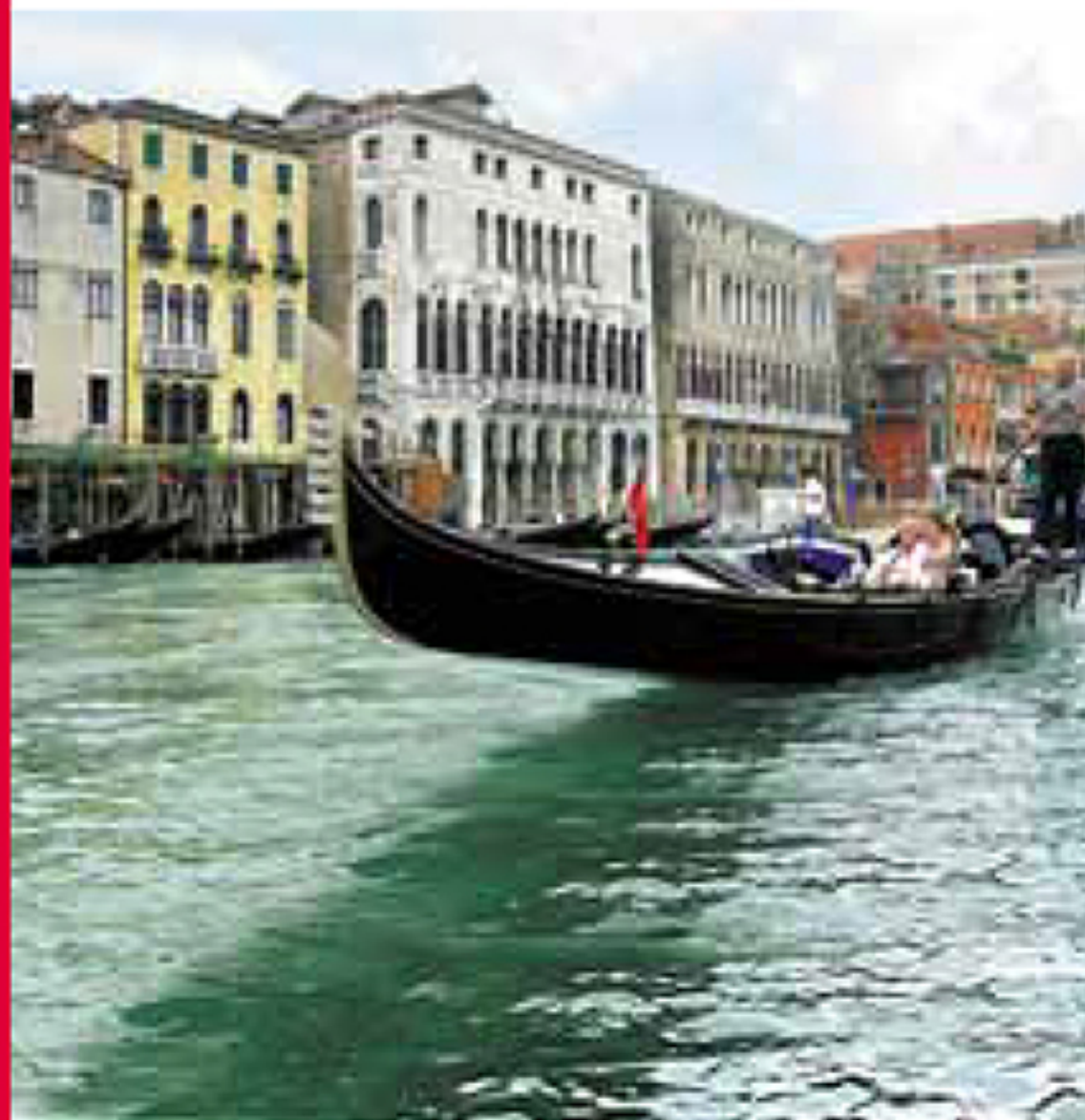
Gondola Ride - Venice

After a buffet breakfast, check out and drive to the charming Principality of Liechtenstein. On arrival into Vaduz, enjoy a mini train ride that takes you around this quaint town. After lunch, proceed to Innsbruck, in picturesque Austria. Feast your eyes on some spectacular scenery as you drive to Wattens - Austria. Get set for a glittering experience as you visit the Swarovski Crystal Museum in Wattens. This museum is a blend of art, technology and pure magic. Later, drive to the Tyrolean