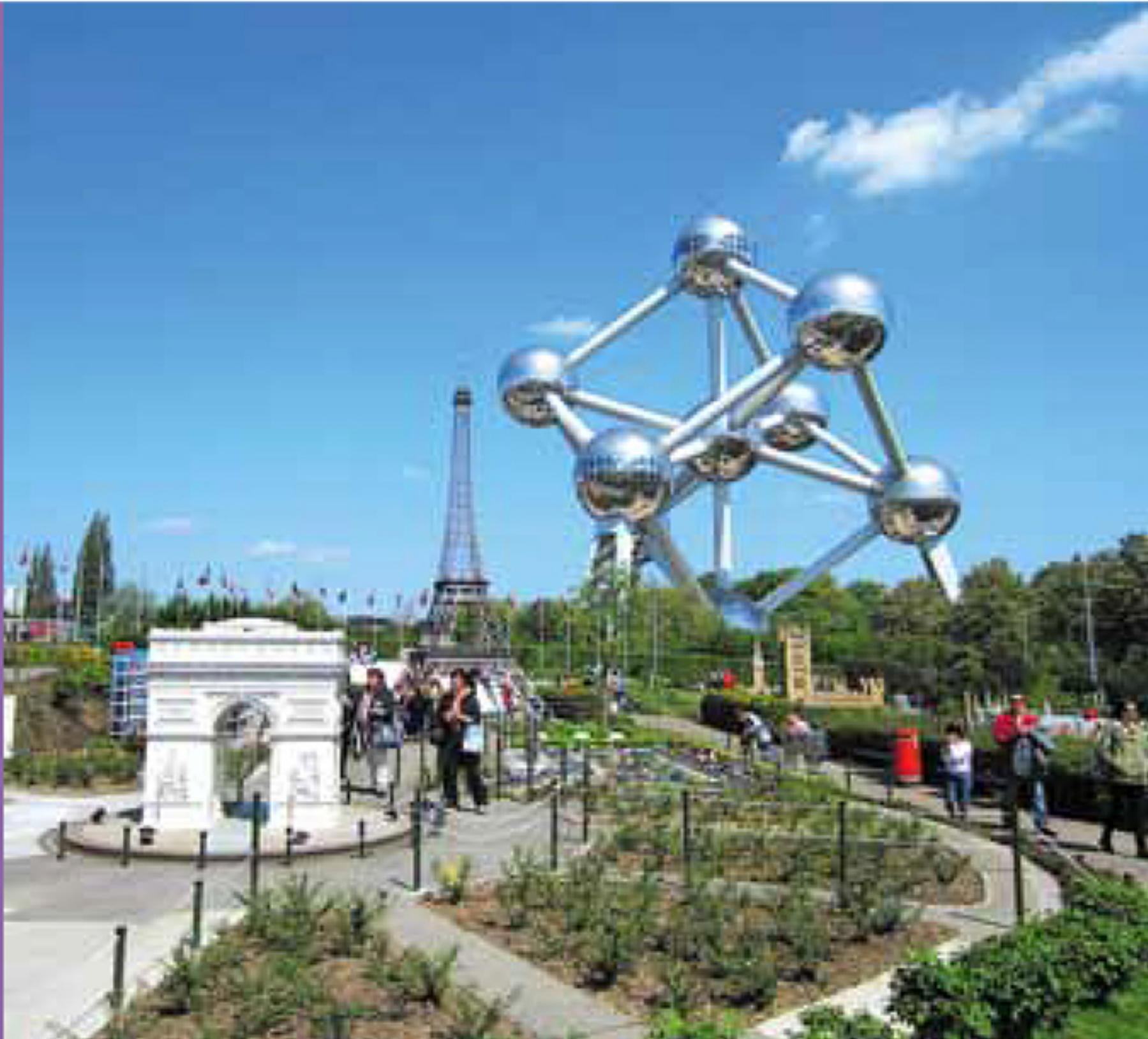
Mini Europe - Brussels

sound and dance extravaganza - The Lido Show.