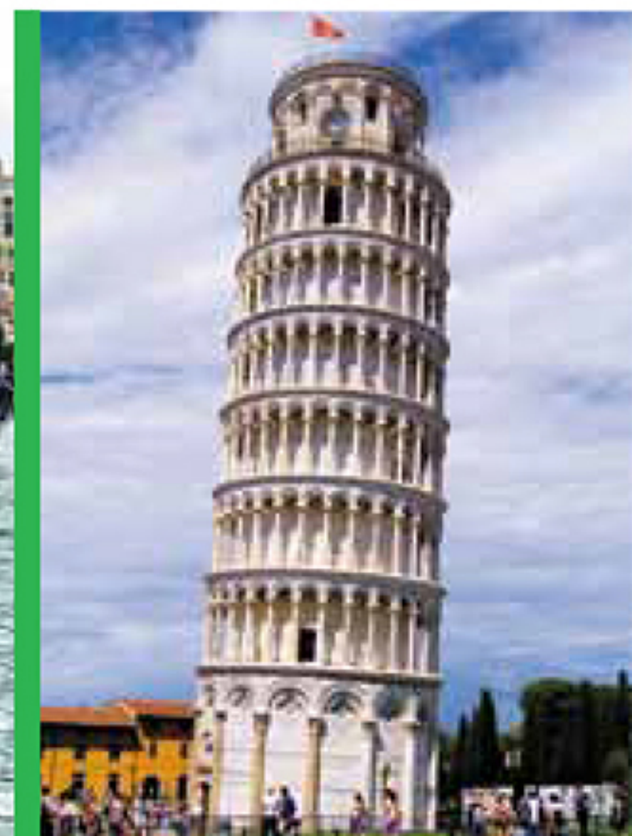
Leaning Tower of Pisa

capital - Innsbruck and experience the charm of this city as you see some intriguing sights like the Golden Roof and St. Anne's Column on Maria Theresien Strasse, from where you get spectacular views of the Alps. Tonight, enjoy an Indian dinner.