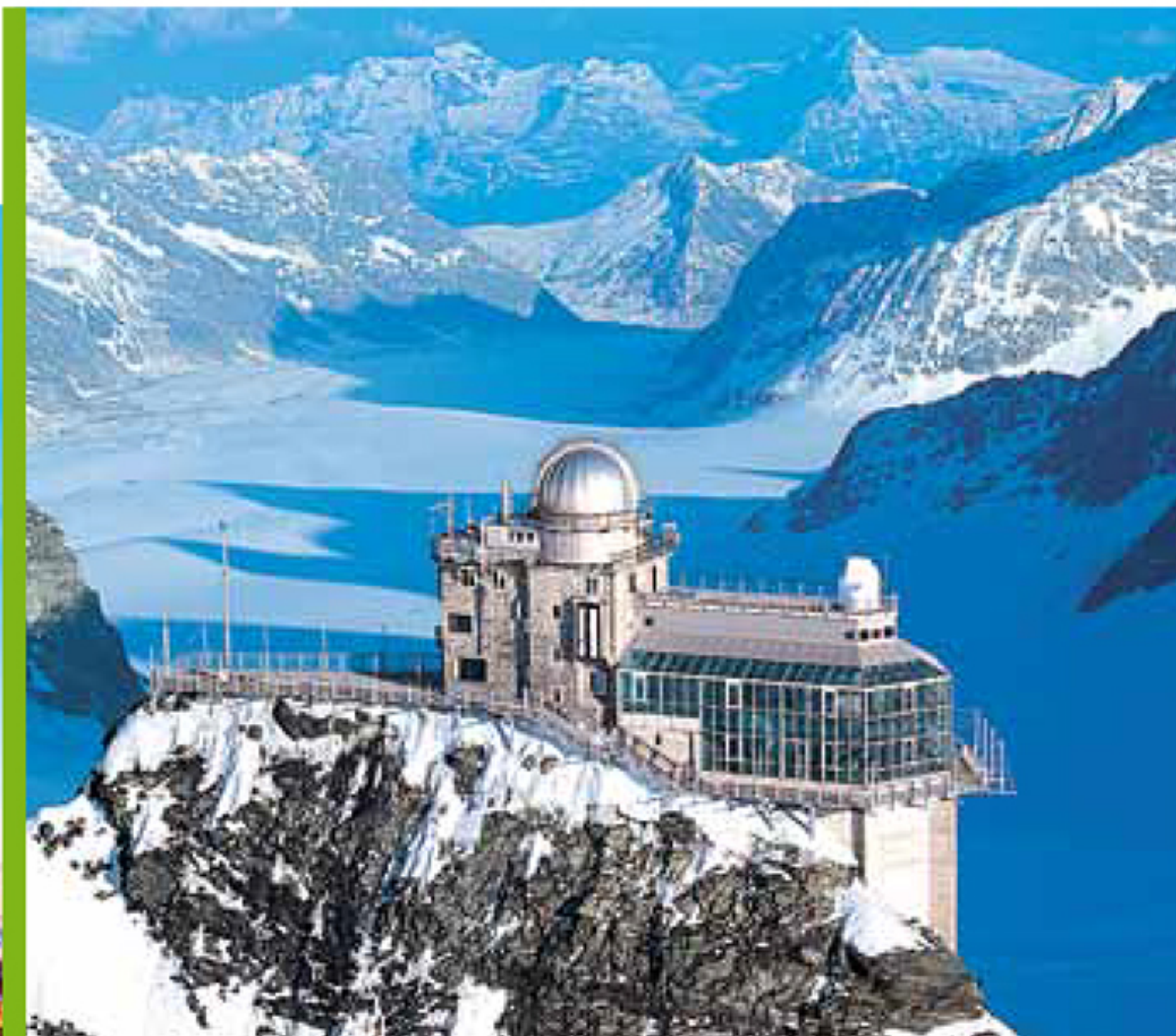
Top of Europe - Jungfraujoch

Onto Cologne - the dramatic German city. Romantic Rhine Cruise. Heidelberg - Visit the Altstadt (Old Town). After a buffet breakfast, check out and drive to the city of Cologne - home of the famous Eau de Cologne. Get fascinated