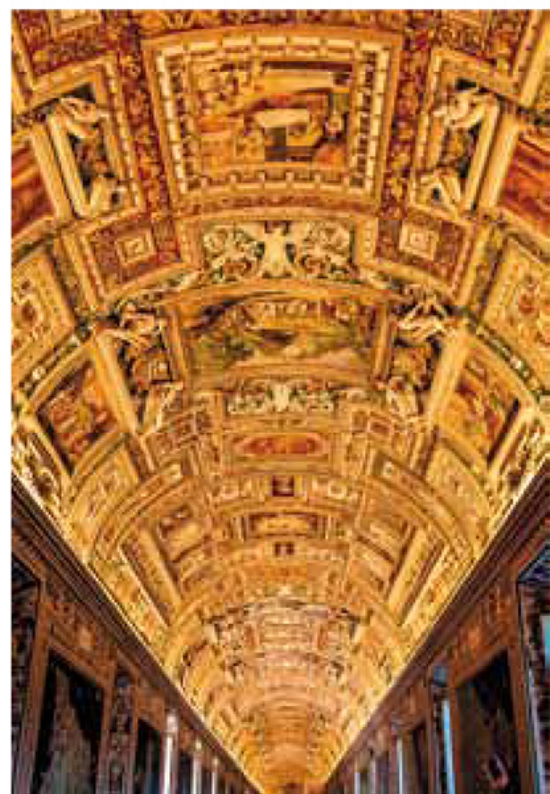
Vatican Museum – The Vatican

After a buffet / boxed breakfast, check out and proceed to the airport for your flight back home. Arrive home with pleasant memories of your European tour, which you will treasure for a lifetime. (B)