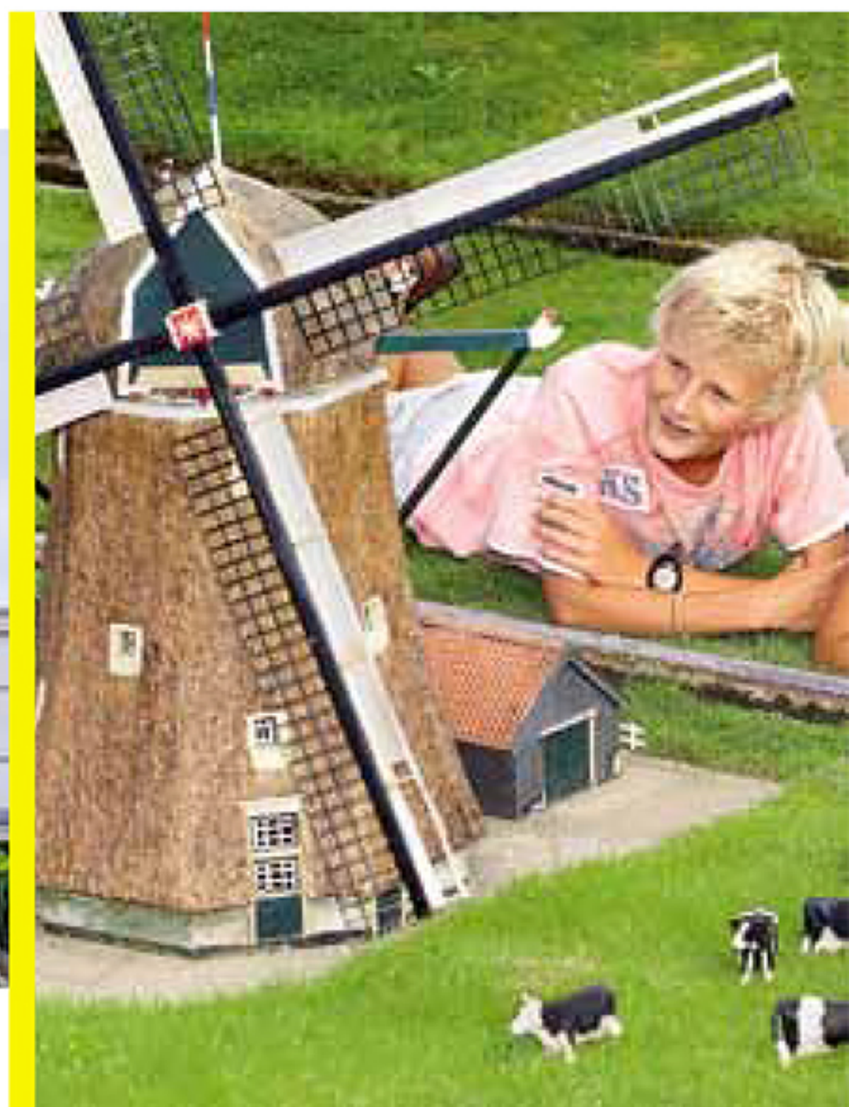
Madurodam - The Netherlands