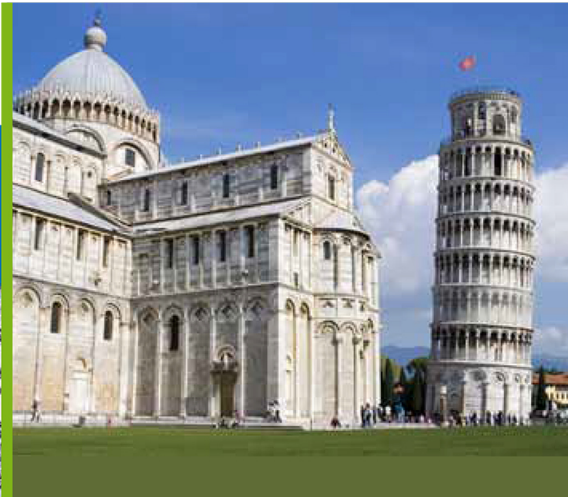
Square of Miracles – Pisa

Overnight at hotel Terrace / Hoheneck / Crystal / Banklialp / Ibis or similar in Engelberg. (B, D)