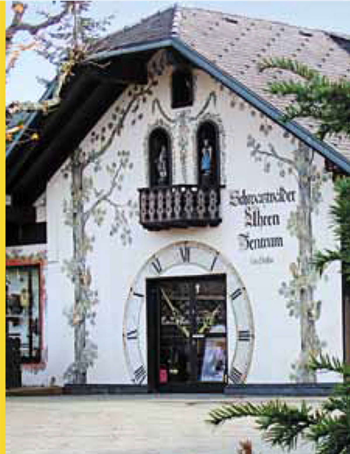
Black Forest - Germany

Visit Salzburg. Drive to Munich. Farewell!!! After a buffet breakfast, check out and drive to Salzburg. On arrival proceed on an Orientation tour of this city. After lunch, drive to Munich. Enjoy an Orientation tour of Munich. Continue to the airport for your flight back home. Arrive home with pleasant memories of your European tour, which you will treasure for a lifetime. (B, L)