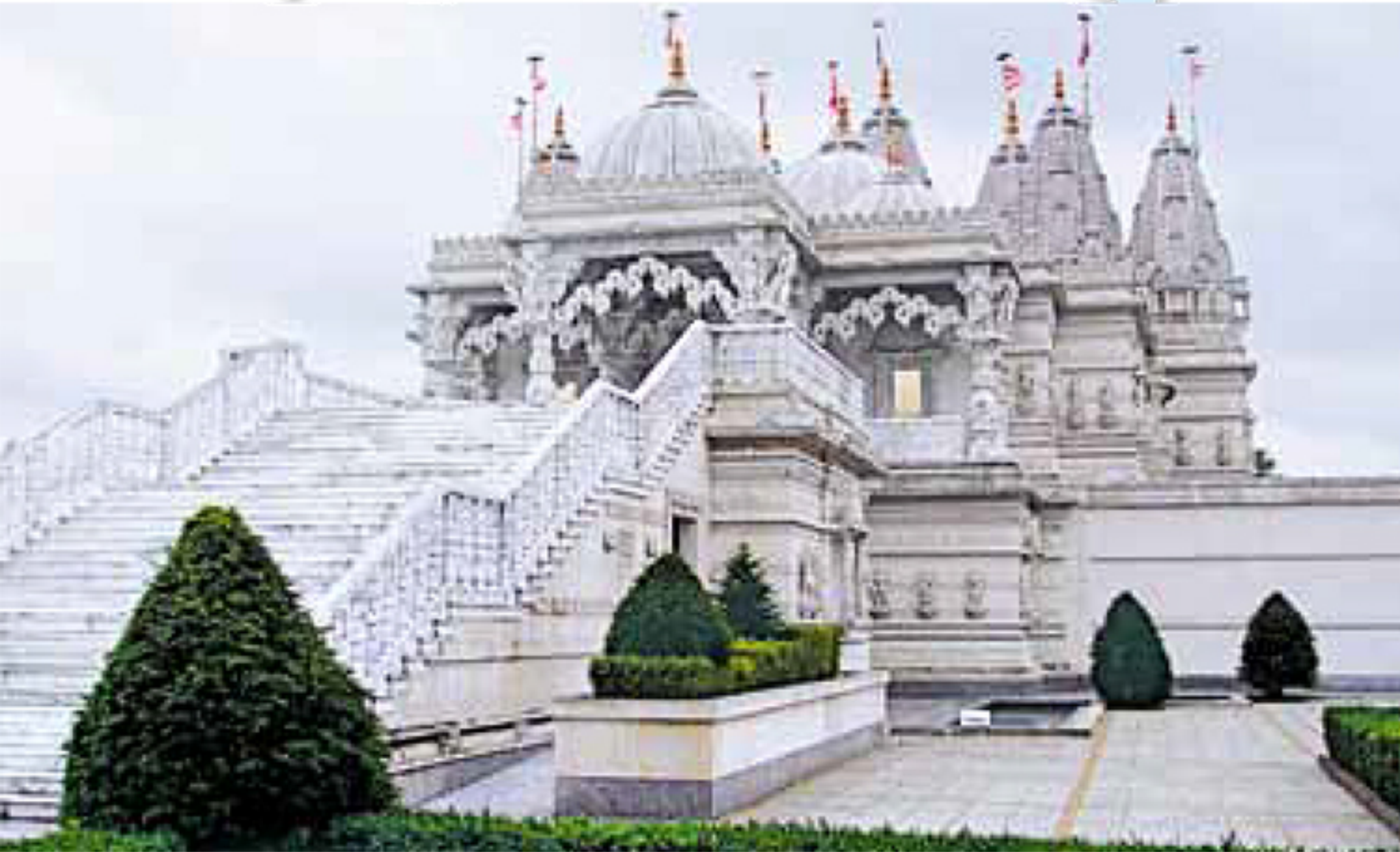
The magnificent Swaminarayan Temple

Overnight on board the Stena Lines Cruise. (B, L, D)