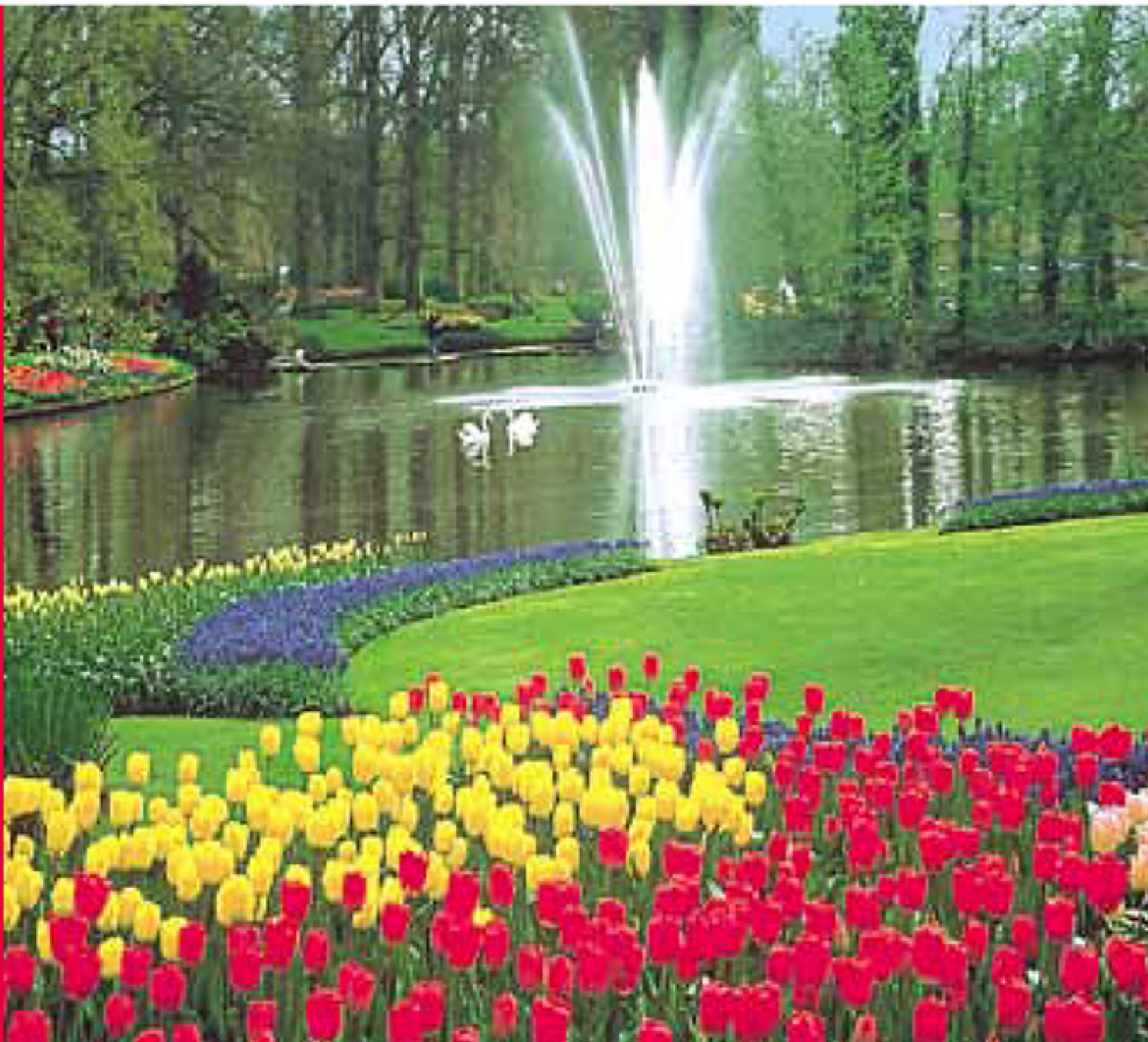
Keukenhof - The Netherlands

Mannekin Pis - symbolic to this city. Later, make a photostop at the Atomium - symbol of Brussels. Tonight, enjoy an Indian dinner.